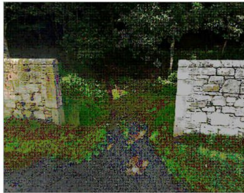
Pedestrian pathway continues between site and nearby farm. Picture above shows existing wall opening, adjacent nearby farm, with pathway continuing to farm.

subject to the requirements of the associated Decision Notice